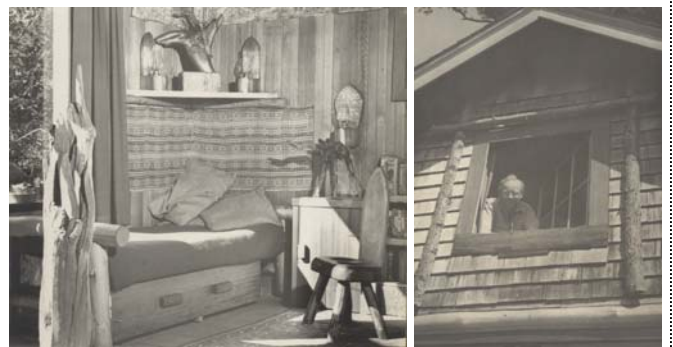
Photos, furniture, artwork and other objects connected to Lieben will all be on display at the Museum & Archives.

This summer, visit the Museum & Archives and discover for yourself this fascinating piece of Bowen heritage. Learn more about Lieben's curious proprietors, its colourful guests, the fate of the Eagle Cliff property, and much more. Along with our Logger's Cabin display and the Cabinet of Curiosities exhibit, the Museum & Archives is set to provide both islanders and off-shore visitors another vivid glimpse into Bowen's past.