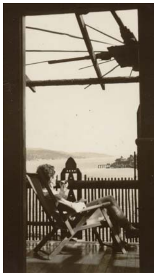
Visit and experience this 'cedar key of quiet.'