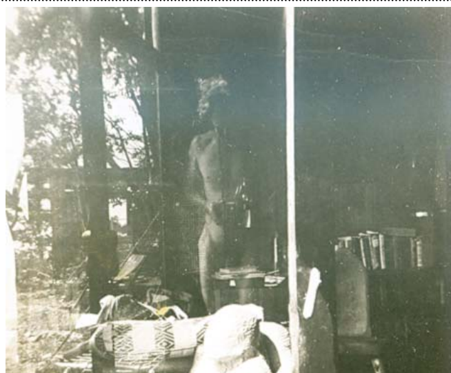
An unidentified man taking his self-portrait with a camera. The nude photographer can be seen in the reflection of the glass door. Lieben, c1950s. Bowen Island Archives collection.