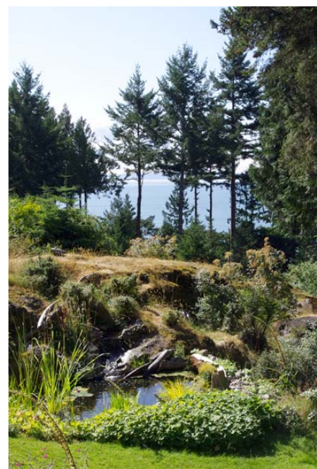
View beautifully landscaped gardens and unique homes on this year's People, Plants and Places Tour. Ticket sale details to be announced in Spring.